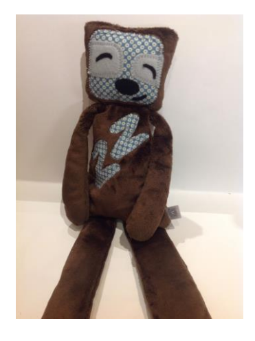
Completed Suzy the Snoozy Sloth sleeping contently!