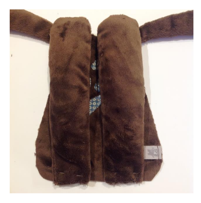
Pin and baste the legs to the front of the body