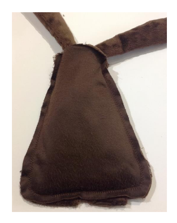
Sewing the body together