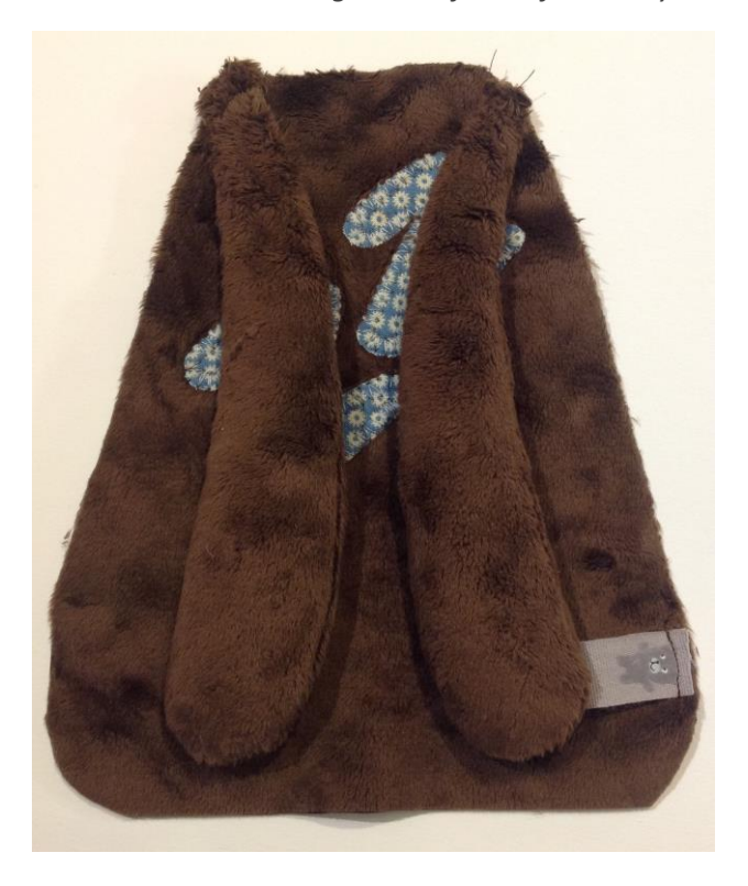
Pin and baste arms to the front of the body

Tucking legs in and leaving the arms outside, place the back of the body onto the front, right sides together and pin. Sew around the body, leaving an opening at the neck and the arms free (see below).