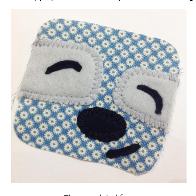
The completed face

Applique around the grey eye pieces using a wide zig-zag stitch and grey thread. Applique round the nose, also using zig-zag stitch. Applique the black felt eyes and mouth using a straight stitch.