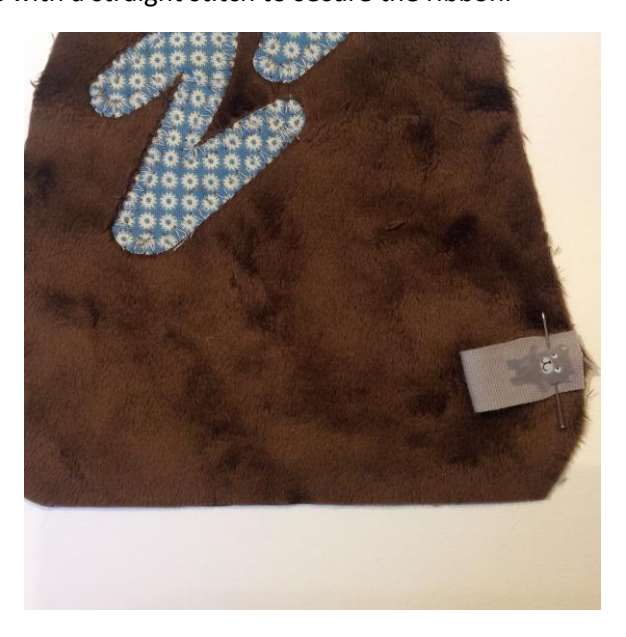
Adding a tag

If you are adding a 'tag', fold your ribbon and place on the right side of the body with raw edges matching and pin. Baste with a straight stitch to secure the ribbon.