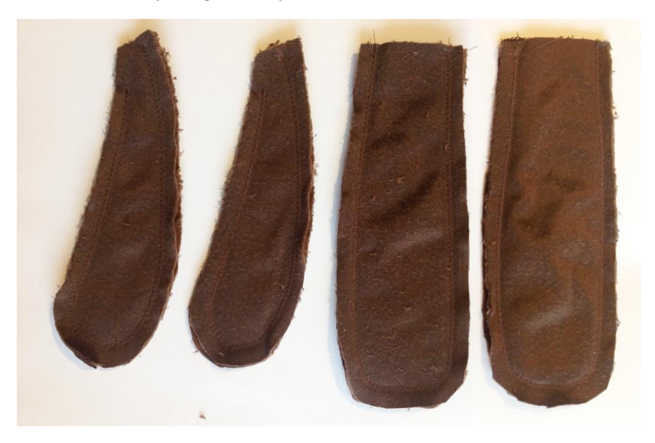
Arms and legs

Pin the leg and arm pieces right sides together then sew around, leaving an opening at the top of each arm and leg. Trim round the seams, making v-shaped notches on the corners. Turn right side out and stuff. Sew the arm openings shut by hand.