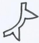
Mouth - cut 1 from white felt